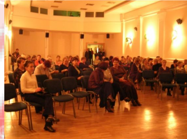
8th of March "Women's day" – meeting with social life actress

Szczecin Television was accompanying training "ABC of carrying business. How to prepare business plan?". TVP Szczecin also visited entrepreneur women from Dębno, who started business half year ago and was a member of Dębno WRC. 27th of April 2006 at 6.30 pm was broadcasting programme about entrepreneur women from Dębno.