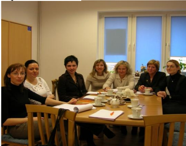
Meetings of centre leaders in Dębno, 20-21 February 2006