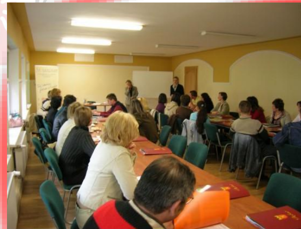
July 2006 – Participants of the “Business Plan” workshops