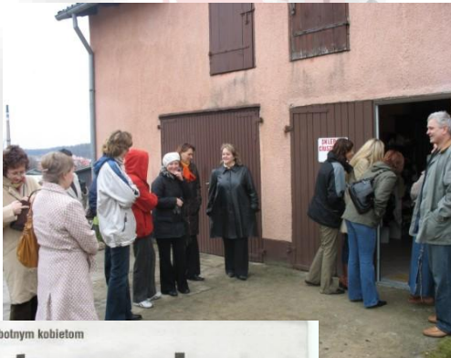
LĘBORK. Centrum pomaga bezrobotnym kobietom